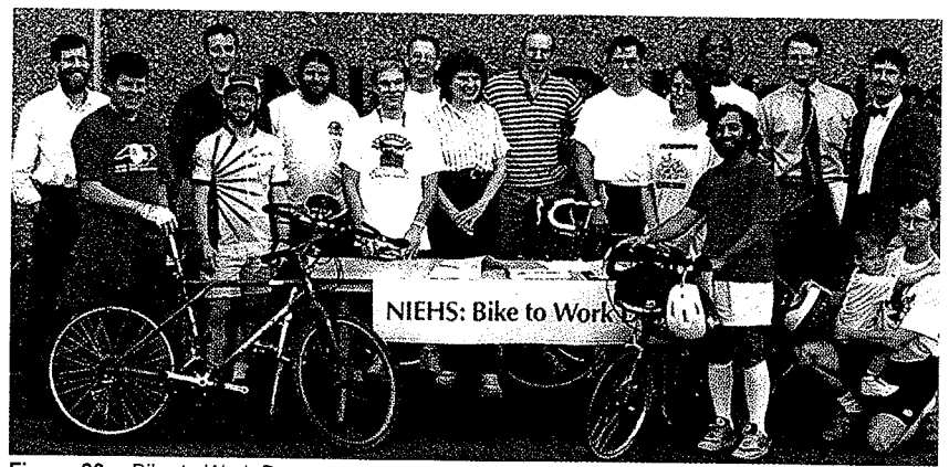
Figure 23 Bike to Work Day: promotion of physical activity at the National Institute of Environmental Health Sciences (NIEHS) in the United States

although McGuire et al. (1999) did not find such an association. Jeffery et al. (1984) reported that physical activity immediately after weight reduction, but not one year later, was associated with less weight regain at two years' follow-up.