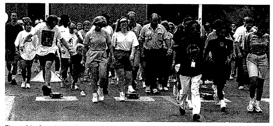
Figure 24 Organized walking day for NIEHS staff members and family

counselling into routine primary care and other health services. It is also not yet clear what effects might be achieved by mass-reach, ubiquitous public health strategies that offer 'passive' protection to populations by creating (or recreating) environments in which physical activity is a natural and enjoyable part of people's lives.