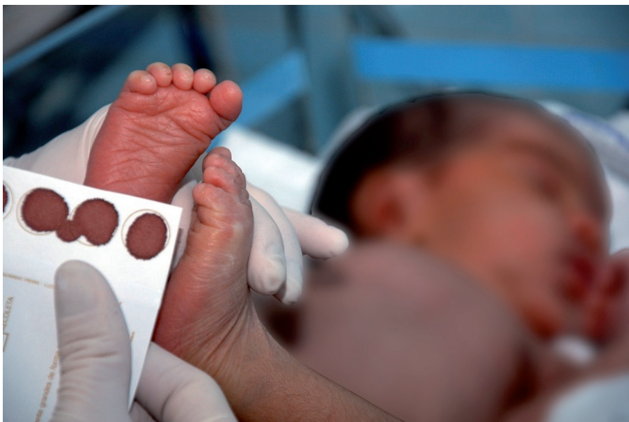
Figure 3. TP53 R337H mutation and Newborn screening

Presence of a common TP53 mutation in 0.3% of the population of South Brazil has led to questions about whether it was appropriate to screen newborns for this mutation in order to better detect subjects at high risk of cancer. Studies by IARC and collaborators have argued against this approach, considering that there is not enough evidence to predict the risk of cancer over lifetime. Childhood predictive genetic testing for R337H should not be carried out in mass screening programs, although it may represent a suitable approach in some families, on a case-by-case basis and within counseling and follow-up strategies that take into account the wide diversity of tumour patterns in mutation carriers