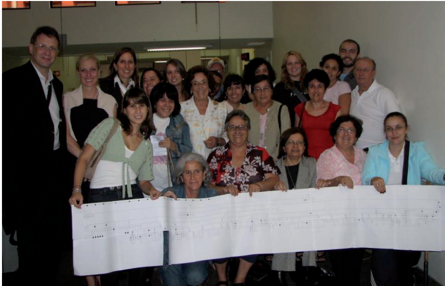
Figure 2. A gathering of subjects from cancer prone families, proudly showing their familial tree spanning 8 generations