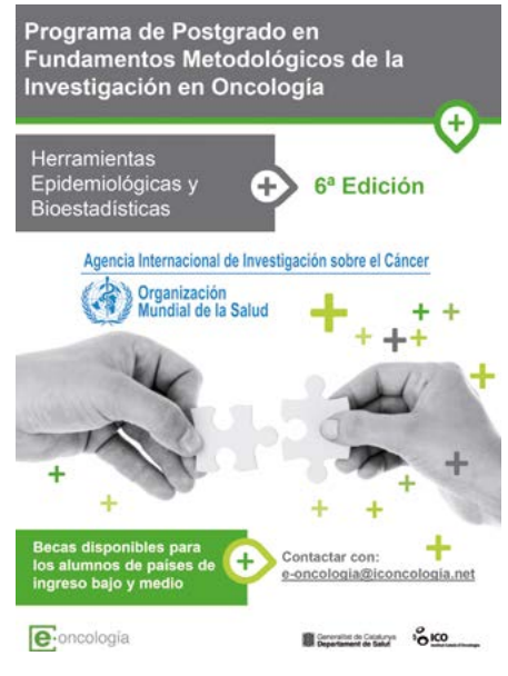
Figure 3. Flyer for the joint IARC-ICO online course in cancer epidemiology.

online course in cancer epidemiology aimed at Latin American countries ( http://www.e-oncologia.org/cursos/postgrado-fundamentos-metodologicos-investigacion/#.VjO5lNKrTIU ; Figure 3), and with the London School of Hygiene & Tropical Medicine (United Kingdom), involving IARC's contribution to the contents of an e-Learning module, Introduction to Cancer Epidemiology ( http://dl.ishtm.ac.uk/download/open-access/gn09/EPM307_GN09_010_010.html ).